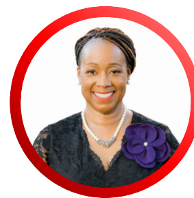
IMMEDIATE PAST PRESIDENT